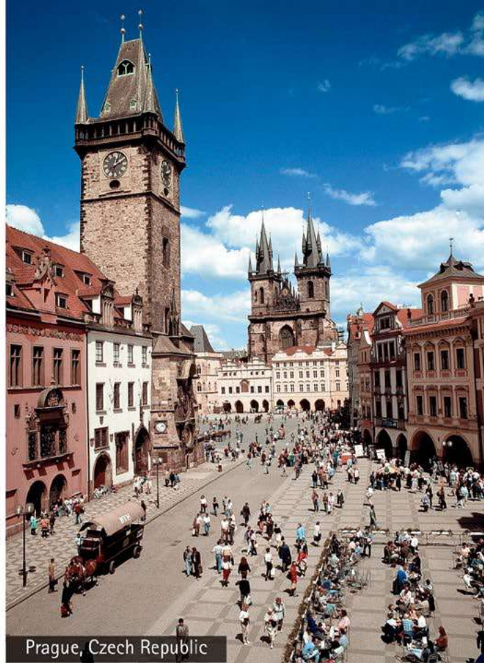
Prague, Czech Republic

*from prices are per person based on twin share in low season